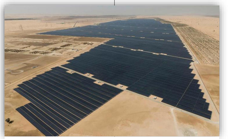
The Noor Abu Dhabi single-site solar plant is claimed to be the largest in the world with a production capacity of nearly 1.2 GW

for the nation's entire electrical grid and all new vehicles and buildings to be carbon pollution free by 2030. Washington now joins California, Hawaii, and New Mexico, which have all established either renewable energy mandates or clean energy mandates with the 2045 target. Washington, D.C., passed a bill last year establishing 2032 date for a 100 percent renewable energy mandate, and Puerto Rico this year established a 100 percent renewable energy mandate by 2050. Washington, which relies heavily hydroelectric power, already generates more than 75 percent of its electricity from carbon-free sources, including renewable Existing hydroelectric energy.